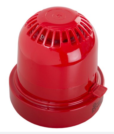
XPA-CB-14001-APO XPander Sounder and Sounder Base