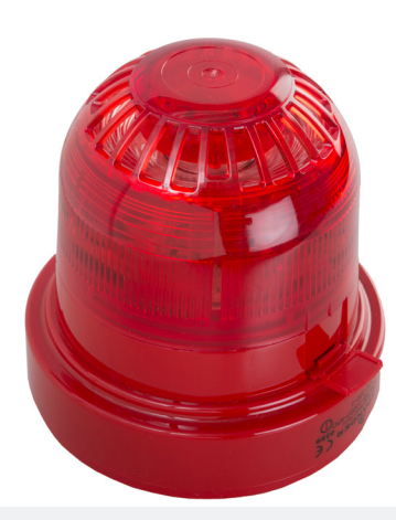
XPA-CB-14003-APO XPander Sounder Visual Indicator and Sounder Base