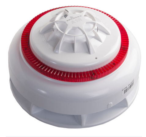
XPA-CB-14021-APO Combined Sounder Visual Indicator (Red) and Heat Smoke Detector