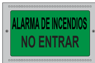
Special designations example