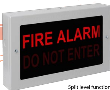
Split level function