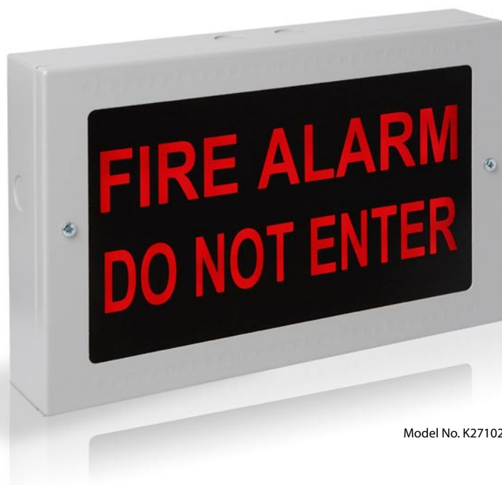
Model No. K27102