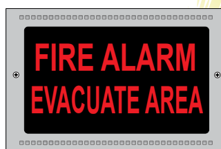
Model No. K27101