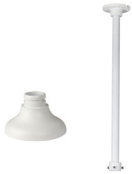
PFA106+PFB220C Adapter Plate + Ceiling Mount Bracket